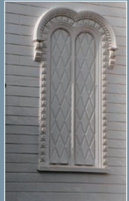
Decorative Window Treatment