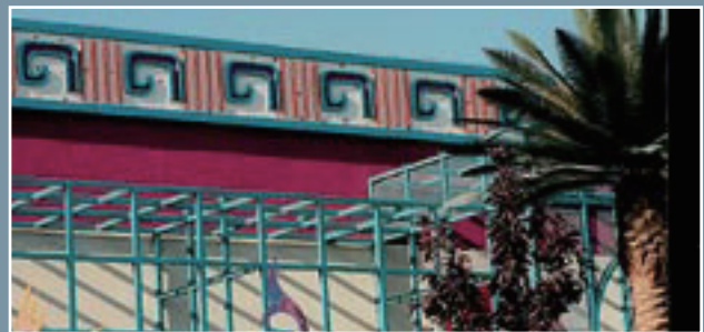
Panel Cresting on Casino • 51 1/2" Height • 68" Length of Panels