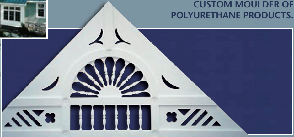
Gable End Decoration • 124 1/4" wide x 77 3/4" height