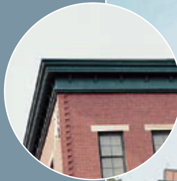
Moulding with brackets, pre-finished in the factory

This church steeple was manufactured using polyurethane and PVC board over an aluminum truss structure.