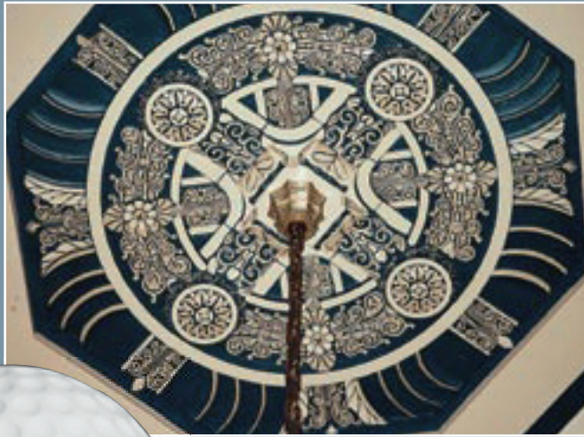
72 1/2" Custom Medallion with Venting made for Casino

Utilizing our quoting department, SPECTIS can provide pricing, shop drawings and specifications for approval prior to turning your custom design over to SPECTIS' Master Pattern Shop.