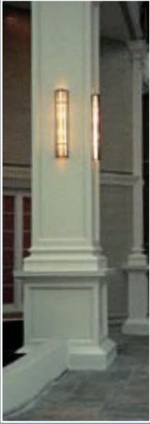
Columns • 5' x 5' x 24'