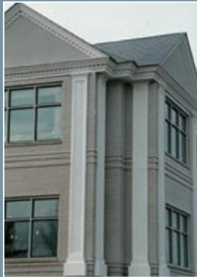
26' Tall Exterior Pilasters

The possibilities are literally endless . . .