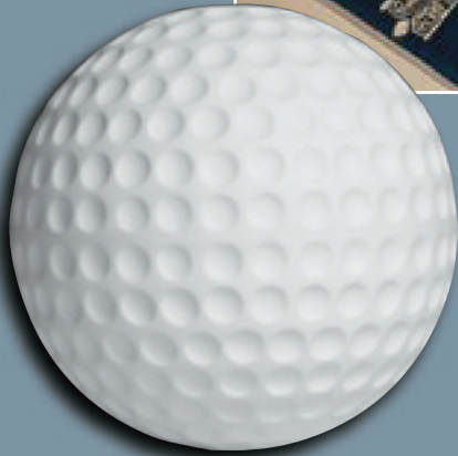
Large Golf Ball • 11 7/8" Diameter

Interior or exterior, small or large, clean and simple or full of complexity, send us something to talk about.