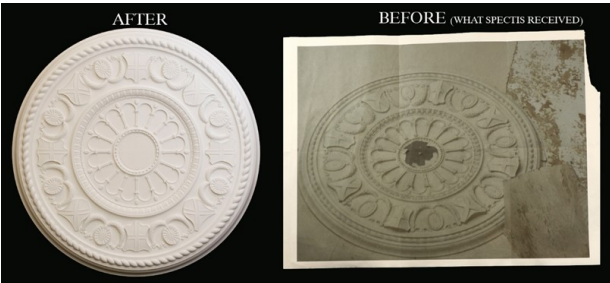
SPECTIS MOULDERS INC. Diameter: 4" Projection: 3" REPLICATED FROM PHOTO

However, in some cases we were only provided an old photograph to work from. With our design, engineering, and drafting capabilities, we were able to reproduce these parts to look exactly like the original pieces from the old building.