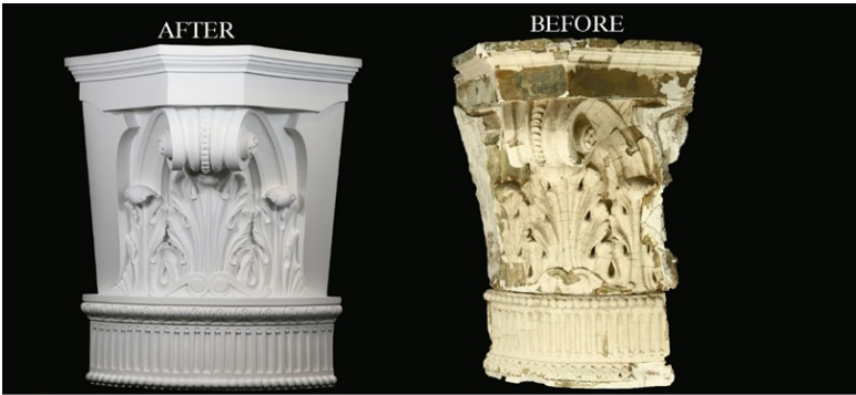
SPECTIS MOULDERS INC. Height: 23 3/4" Width: 33 11/16" FABRICATED & SHIPPED IN QUARTERS

Spectis Moulders Inc. was sent original plaster pieces that were taken off the building to be replicated. These original parts came as damaged, crumbled pieces of plaster.