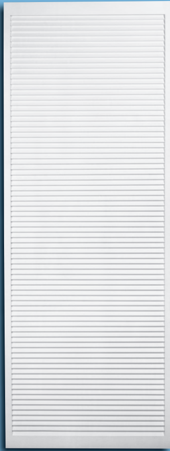
Closed Louvre Shutter • 1 1/4" Projection

SPECTIS ADHESIVE MUST BE USED ON ALL BEDDING/BUTT JOINTS.