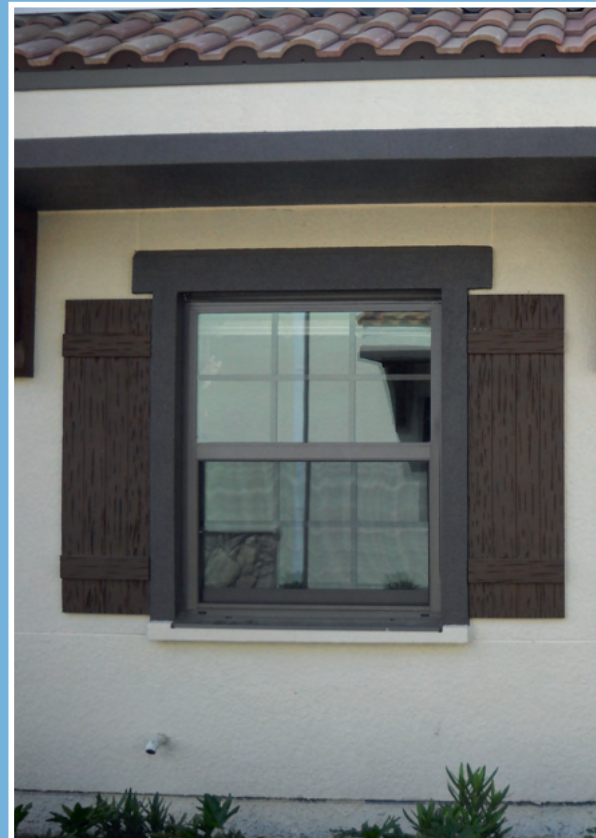
Photo shows use of Spectis custom shutters in pecky cypress texture