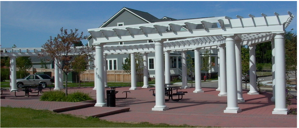
Follow us on Facebook and Instagram for pictures, information and projects.