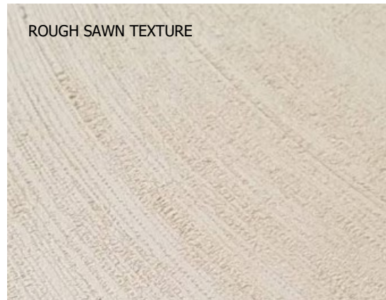
ROUGH SAWN TEXTURE